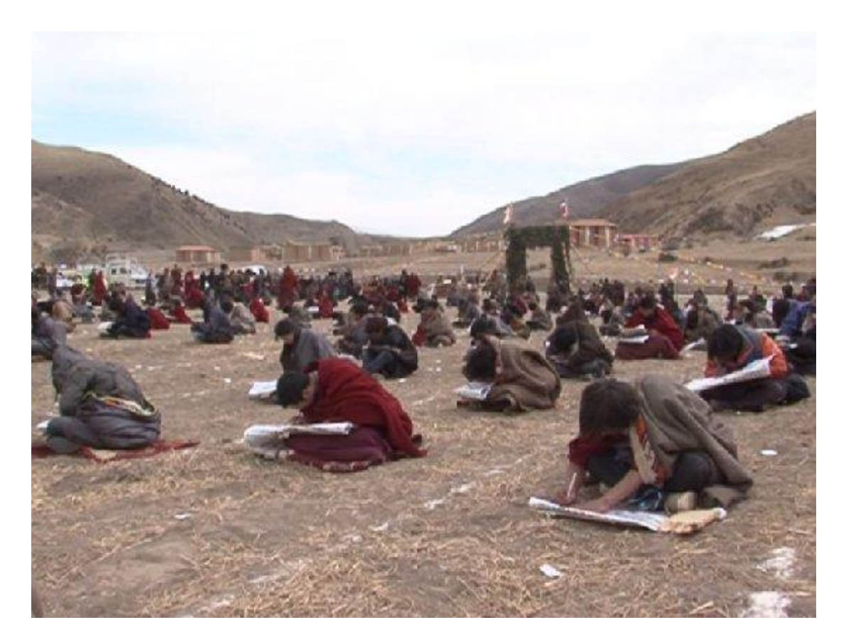
Tibetan language classes

to take note; eight policemen came and ordered the monks not to hold any further classes.57